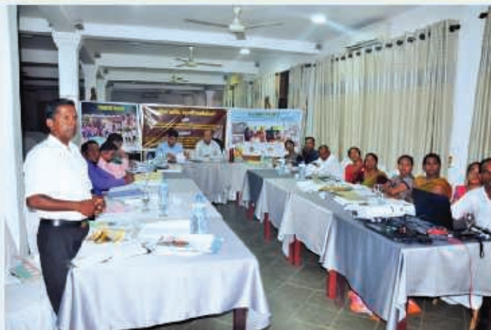
An event of the field activities training held in the Department for field officers in 2017