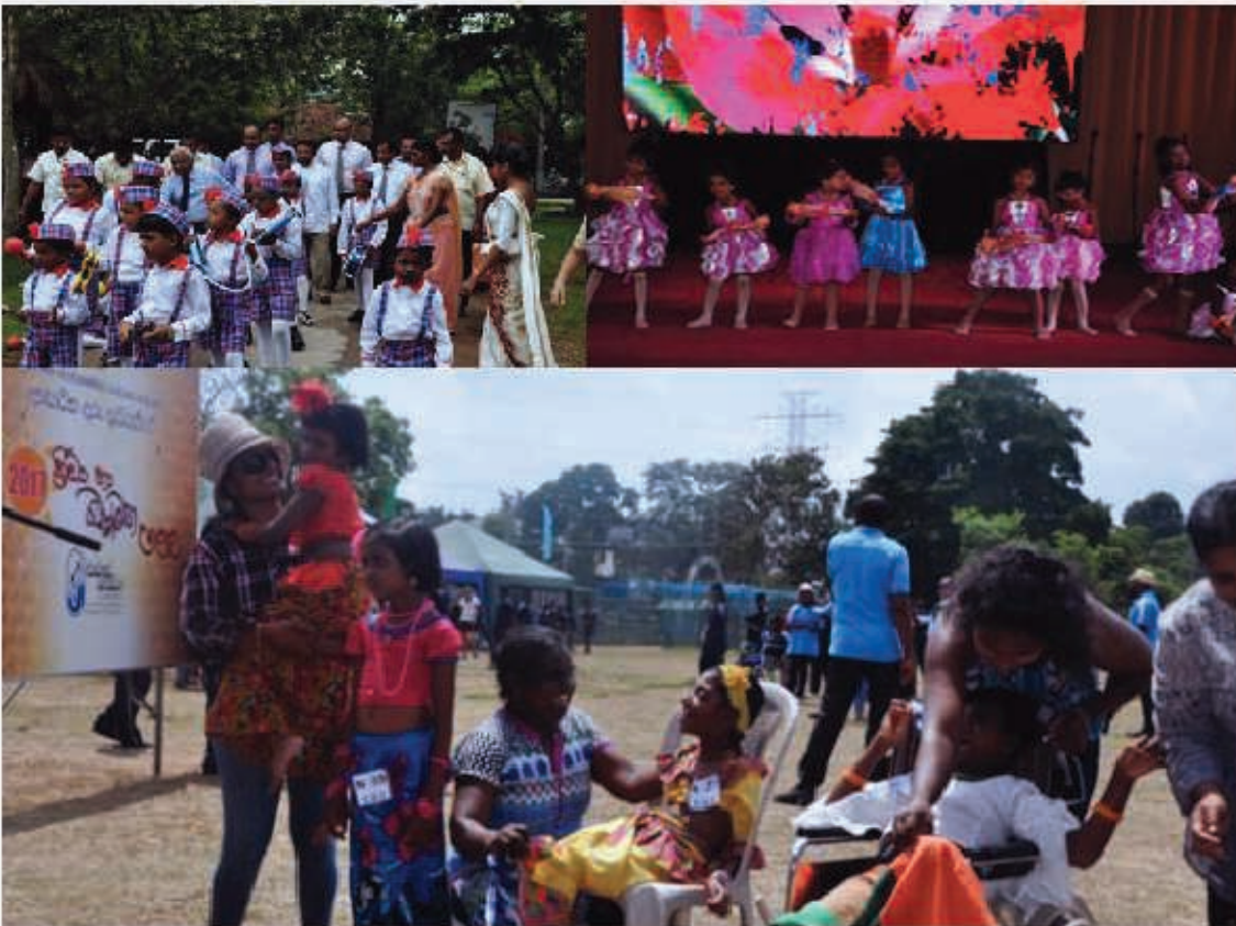
An event of extra curriculum activity of the children in Maharagama children guidance center