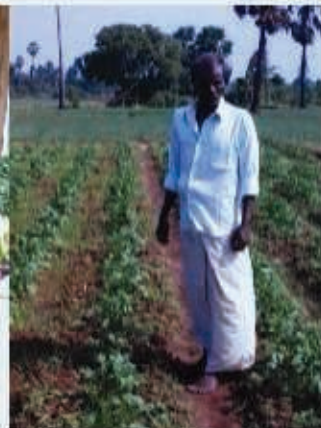
Peanut cultivation - Mulaitivu