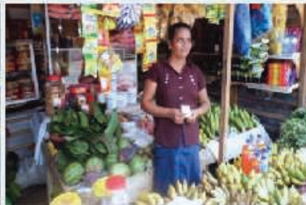
Markerting Project - Rathnapura