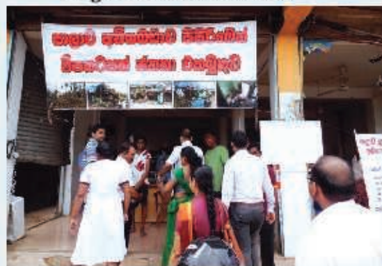
Programme of salawa area