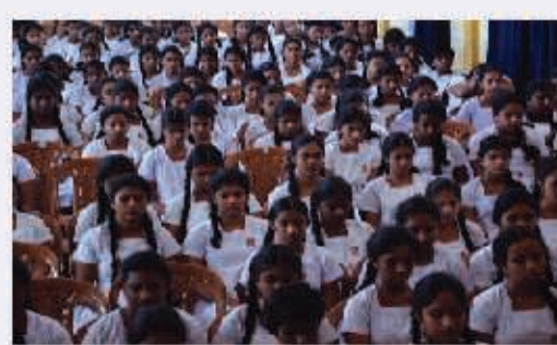
School children awareness programme – Swarnajayanthi maha vidyalaya, Kegalle