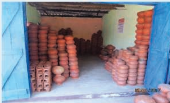
“Samurdhi Abimani” Trade exhibition - - Trincomalee District

Expenditure up to 31.08.2017 Rs. 28.85 mn