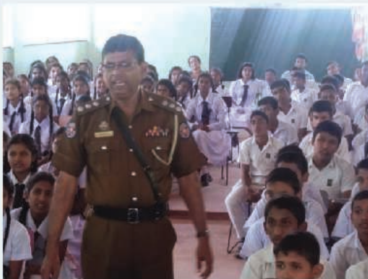
Drug prevention programme Medawachchiya Divisional Secretariat - Anuradhapura