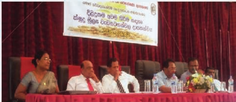
Open Discussion Programme –Passara