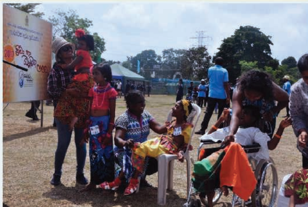
An event of the sport meet and new year festival of disabled children held in Baththaramulla G.H.Buddadasa ground in 2017