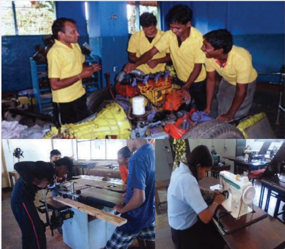
In an occasion of a training of disabled children in the vocational training centers