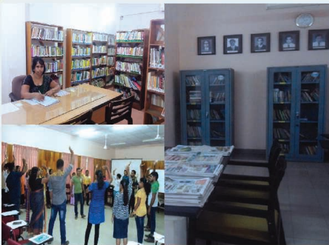
Participatory Leadership Skills Development Training