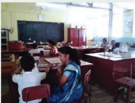
Programme of Meethotamulla