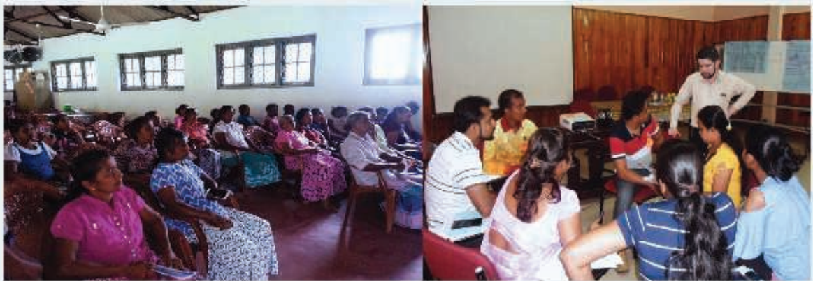
No poisonous tomorrow - Gokarella