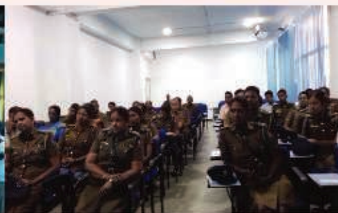
A Short Term Training Programme which was conducted for police officers