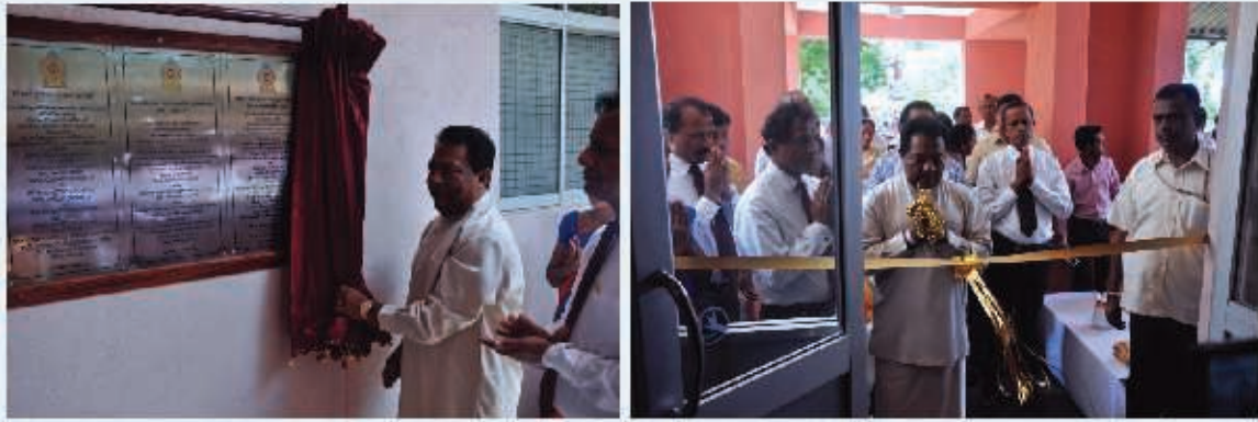
Opening ceremony of the new hostel for disabled children at Thelembuyaya vocational training center in 2017