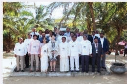
Conducting forum of Parliamentarians on population and sustainable development