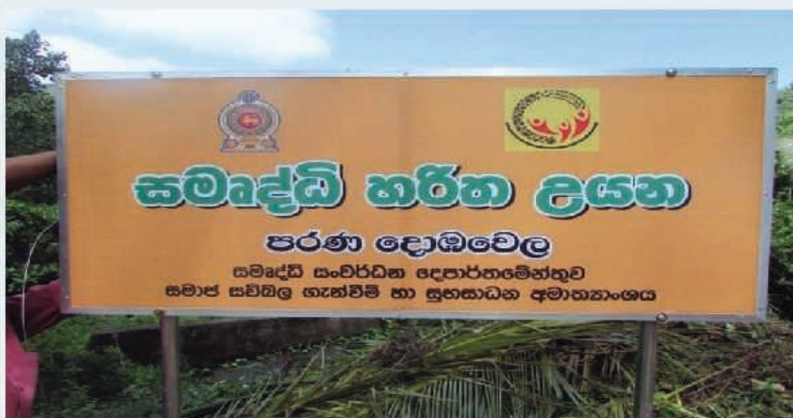
Matale divisional secretariat, tank reservation – parana dombawela