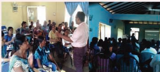
A Short Term Training Programme which was conducted for Nursery