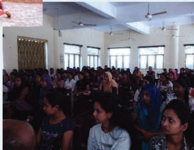
The programme presented by students of Badulla higher technical institution for the national contest of kekulu children societies’