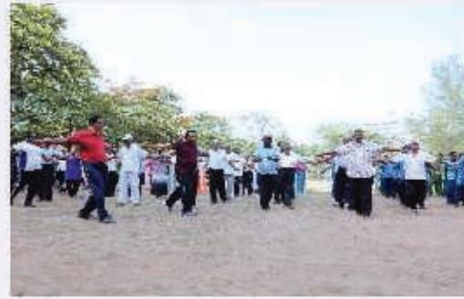
The programme held in physical fitness and sports promotion week for elders and persons with disabilities