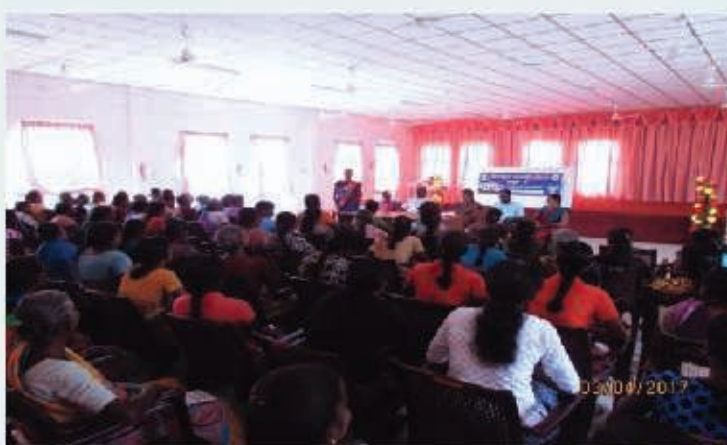
“Happy Family” Programme – Kareinagar Divisional Secretariat