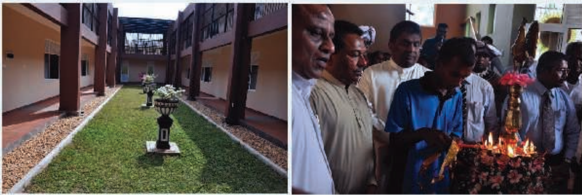
Opening ceremony of the new hostel for disabled children at Aumunakumbura vocational training center in 2017