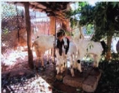
Goat control project