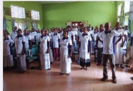
Elders care giving training programme (physical fitness programme)– Seth sewana elders home, meerigama