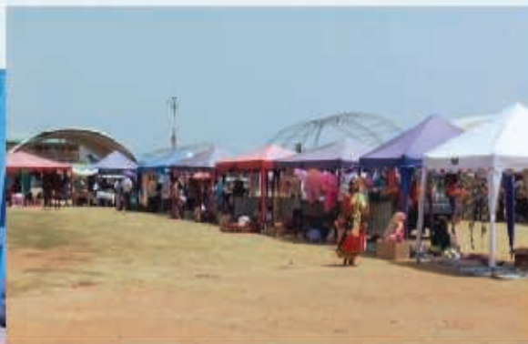
Construction of indoor stores - Matara District