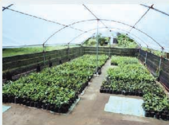
Flower production village at

Expenditure up to 31.08.2017 Rs..44.19 Mn