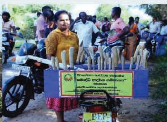
Light industry Village - Badanagala