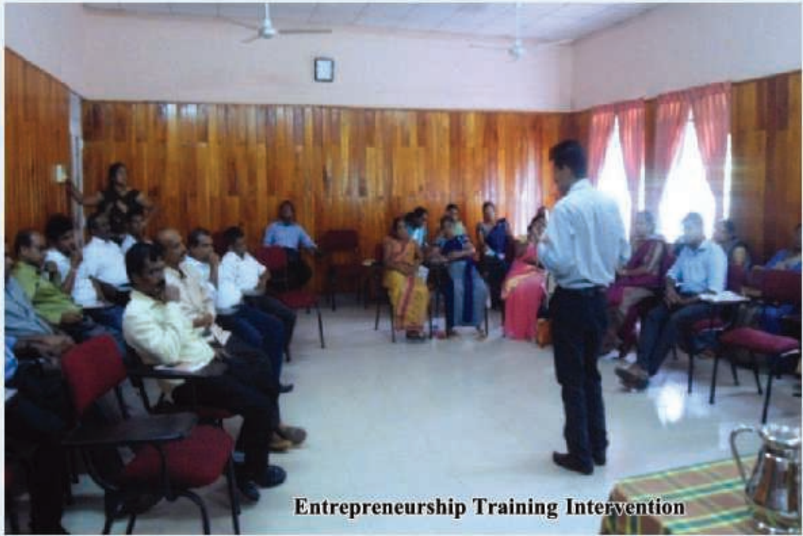
Entrepreneurship Training Intervention