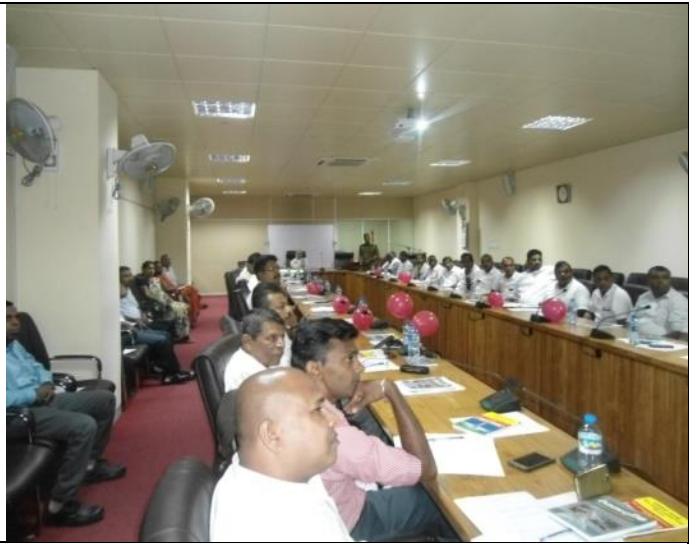
One day work shop on attitude development of Drivers of the Ministry and Affiliated Institutes through developing public relationships and safe driving in compliance with road rules conducted on 27.02.2019