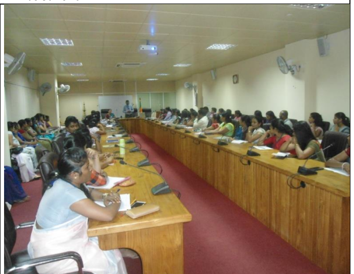
Tamil Language Course for 2 nd category officers who are required to obtain language proficiency by resource contribution of M.I.A.Hafeel, registered Language Instructor of Department of Official Language