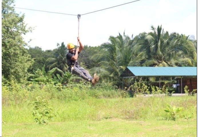
3rd out boundary training for primary level officers of the Ministry and affiliated institutes conducted by resource contribution of Rangiri Aqua (Pvt) Ltd on 11.12.2019 and 12.12.2019.