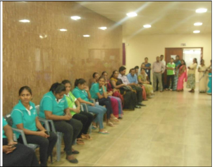
Medical Clinics to prevent from non-communicable diseases and Dental Clinic conducted by Colombo MOH Office on 07.06.2019