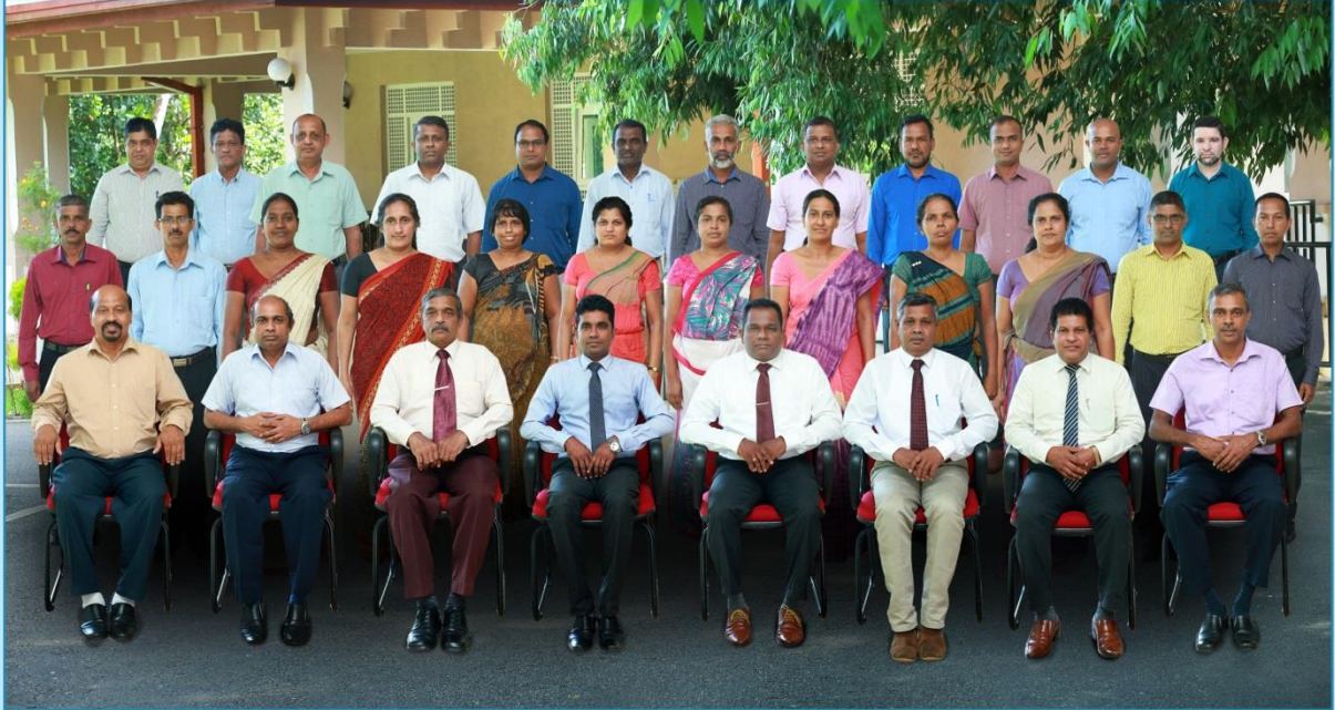
Rural Development Training and Research Institute - Pilimathalawa

TOT for officers of RDTRI on Entrepreneurship and Business development conducted by resource contribution of SIYB Association of Sri Lanka from 14.12.2019 to 23.12.2019